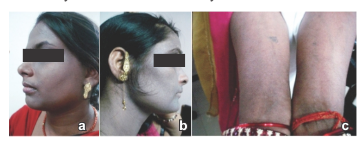
Fig No1 (a, b, c). Patient with predominantly diffuse pigmentation of the face and neck

The closed patches were applied on the back and occluded for 2 days, and the readings were taken on D 2 and 4 according to the ICDRG guidelines. In 6 patients, biopsy specimens were obtained from a pigmented area for histopathological examination. Photo Patch test could not be done because of non availability of Photo Patch test facility.